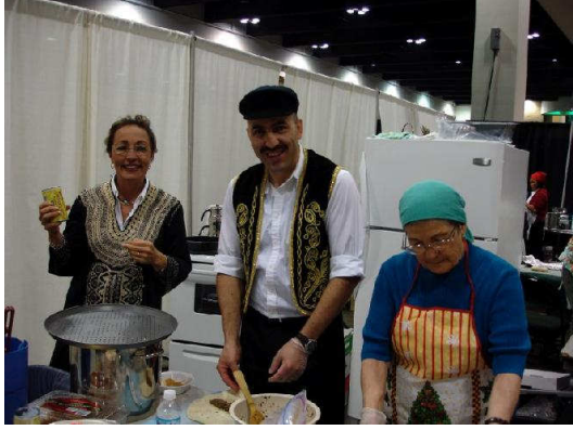
TAAM Folk Dance Performance

Tum gonullulerimiz icin ücretsiz giriş bileti sağlanacak ve Haziran ayında gerçekleştirilecek Gonululerimizi Tesekkür yemegine davet edileceklerdir.