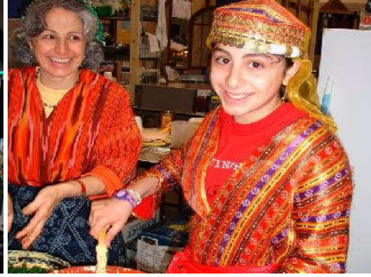
TAAM Halk Danslari Gosterisi

TAAM Folk Dance group has accomplished another successful year at the Festival of Nations with two dances from Ankara region. This year TAAM folk dance team is getting prepared for new folk dances from the region. Those who would like to have fun, get some exercise, and help introduce a part of our culture, please contact TAAM for more information.